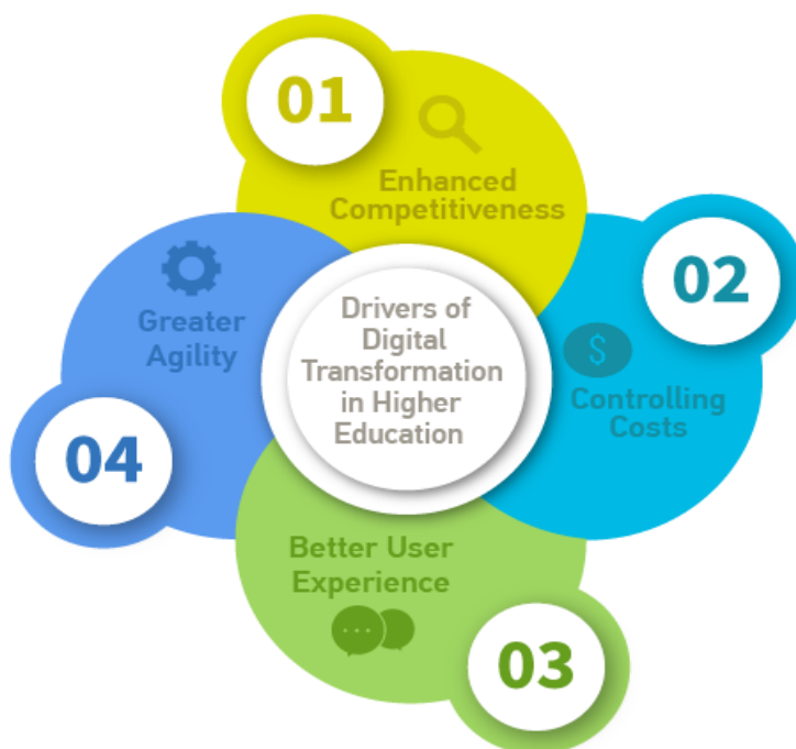
Figure 2. Drivers of digital transformation in HEIs (Digarc, 2018)

First of all, HEIs must become themselves digital organizations in order to provide digital teaching, digital learning, digital experiences, and finally, digital skills for their students. Becoming digital organizations requires digital endowments and specialized staff. It is important that the necessity of change is well understood, is approved and accordingly prepared by all parties involved. Organizational change, implemented in such large structures is likely to meet a certain resistance to change, which might be caused by a different type of factors. Passive factors refer to the individuals' habitude to their work style as well as a certain level of convenience with the daily work routine. On the other hand, there are active factors which include an offensive attitude towards new and alternatives methods or ways of developing tasks. "In this category, we also include the cultural inertia, which means the fear to act differently from the other members of the community" (Bejinaru & Baesu, 2013, p.128). At this point, HEIs should focus on understanding the main drivers of digitalization which are promising to lead to positive results and popularize them (Figure 2).