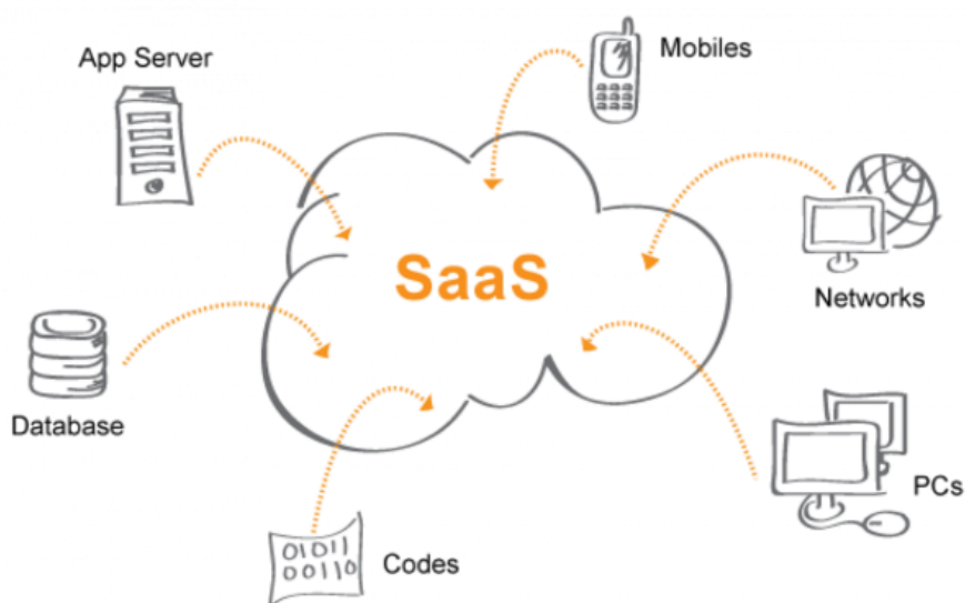
Figure 3. Examples of SaaS solutions (Digarc, 2018)

2. Control of costs : The financial management of the institutions must-have in the foreground the reduction of costs. Moreover, more attention is needed to justify tuition fees so that the cost/benefit ratio is a positive one for both students and the university. An alternative to reducing costs is one that saves on staff time and simultaneously reduces the volume of materials needed for file storage, which is called the spiral administrative method of controlling costs. The emergence on the market of SaaS solutions greatly facilitates the access of HEIs managers to acquire and implement them without spending their time and money with specialized teams or with the IT department. SaaS solutions (Figure 3) are easy to use and contribute to saving time and have a very high return on investment.